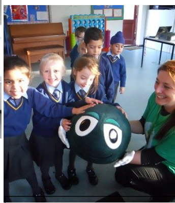
Reception, Year 1 and Year 2 met Buddy today and we learnt who to talk to if we don't feel safe.

You can find out more in the letter sent home today and via the NSPCC website: nspcc.org.uk/parents