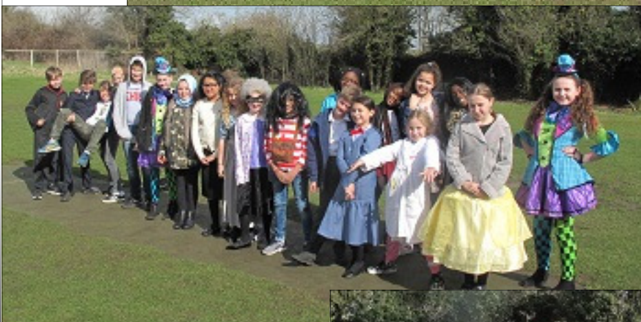
Year 5 (left)