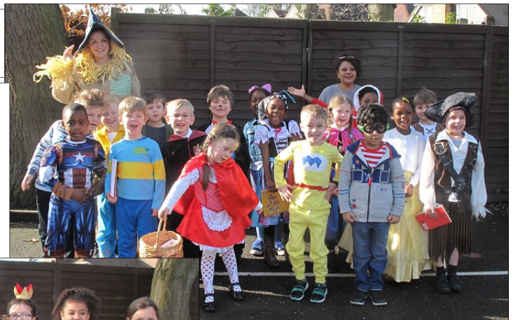
Year 1 (above)

Year 2 children enjoyed dressing up as their favourite book characters. Everyone took a turn to read from their special books that they had brought into class. The children completed some lovely writing based on our day. In Dylan's words : 'It was the best day ever!'