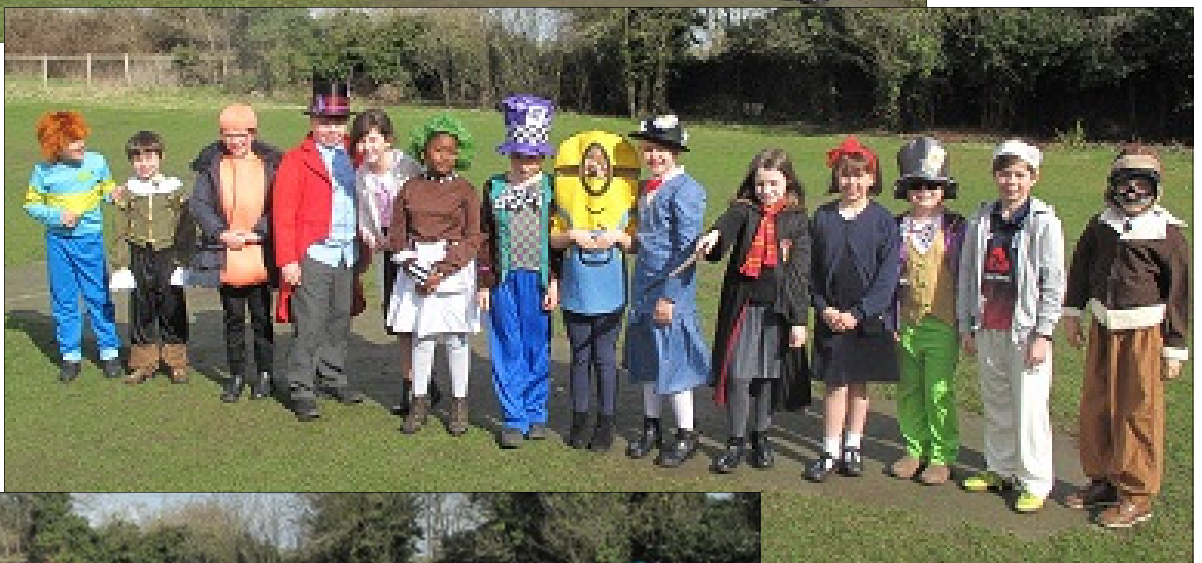
Year 4 (Right)