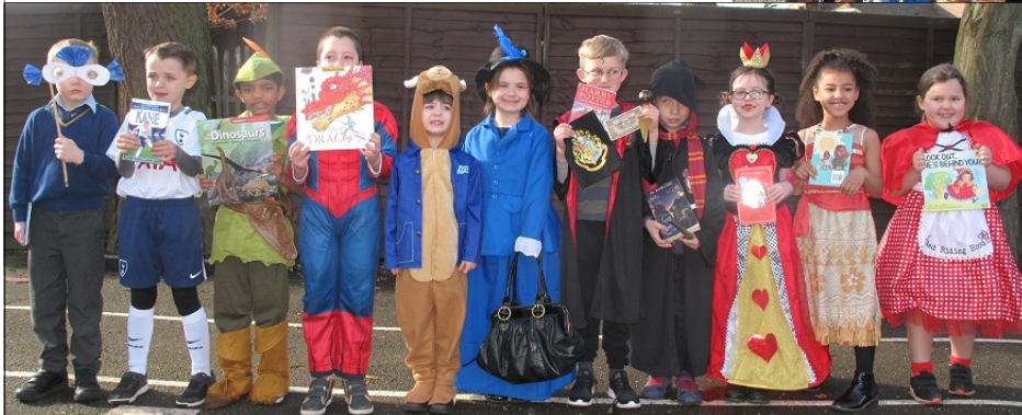
Year 2 (left)