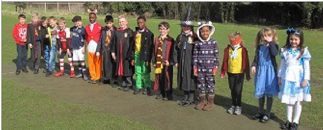
Year 3 (above)