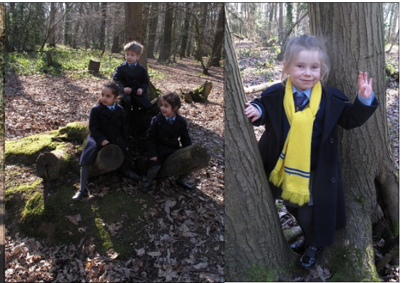
Reception, Year 1 and Year 2 children took advantage of the fine weather on

Wednesday and held an outdoor lesson in the local woods. The younger children enjoyed following the story 'We're Going on a Bear Hunt' while the older children looked at various plants and trees and collected data for their science topics.